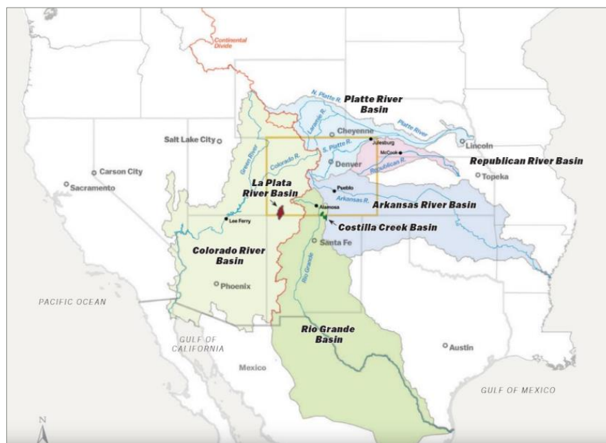
Figure 1 Geography of River Basins Governed by Interstate Compacts

An interstate compact is an agreement between two or more states that has been approved by their state legislatures and Congress. Specifically, a water compact sets the terms for sharing the waters of an interstate river system. The first of these compacts was signed over 100 years ago in 1922 and the most recent in 1968. A map of each of the river basins discussed in this section are shown in Figure 1.