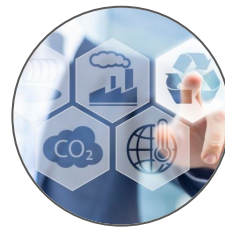
Incentivize sustainable packaging