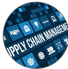
Strengthen local supply chains