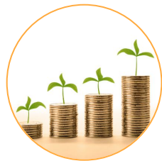
Save local Govts money