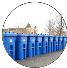
Free & equitable recycling for all