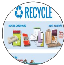
Statewide collection list